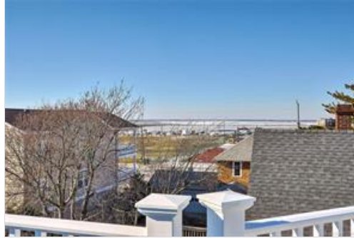
Breathtaking bayviews from rooftop deck