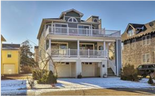
222 Pearl Street