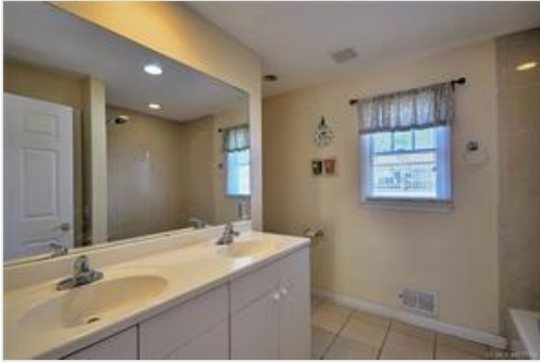
Third full bathroom on First Floor

All information courtesy of Jennifer Hornik Information herein deemed reliable but not guaranteed.