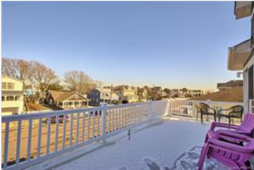
Deck on 2nd Floor