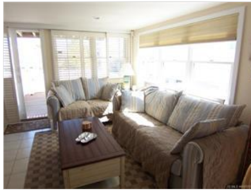
First Floor Livingroom