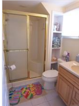
First floor full bath