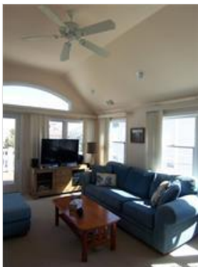
Family room second floor