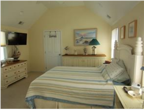
Master bedroom with full bath 2nd floor