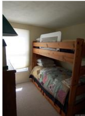
First floor bedroom