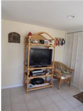
First floor Livingroom